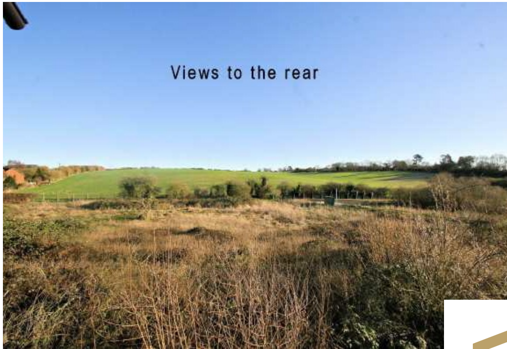
Views to the rear