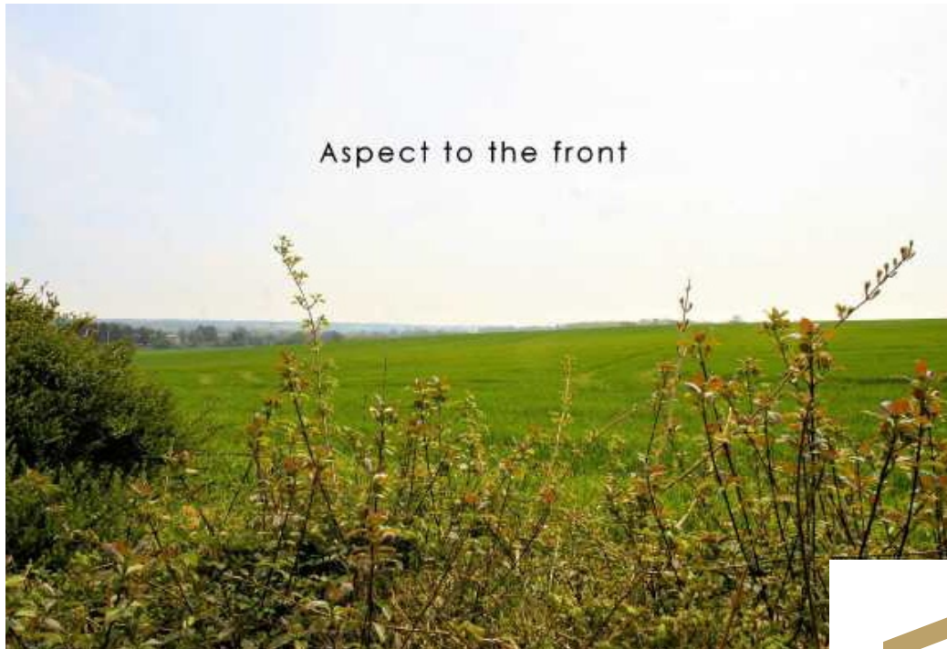
Aspect to the front