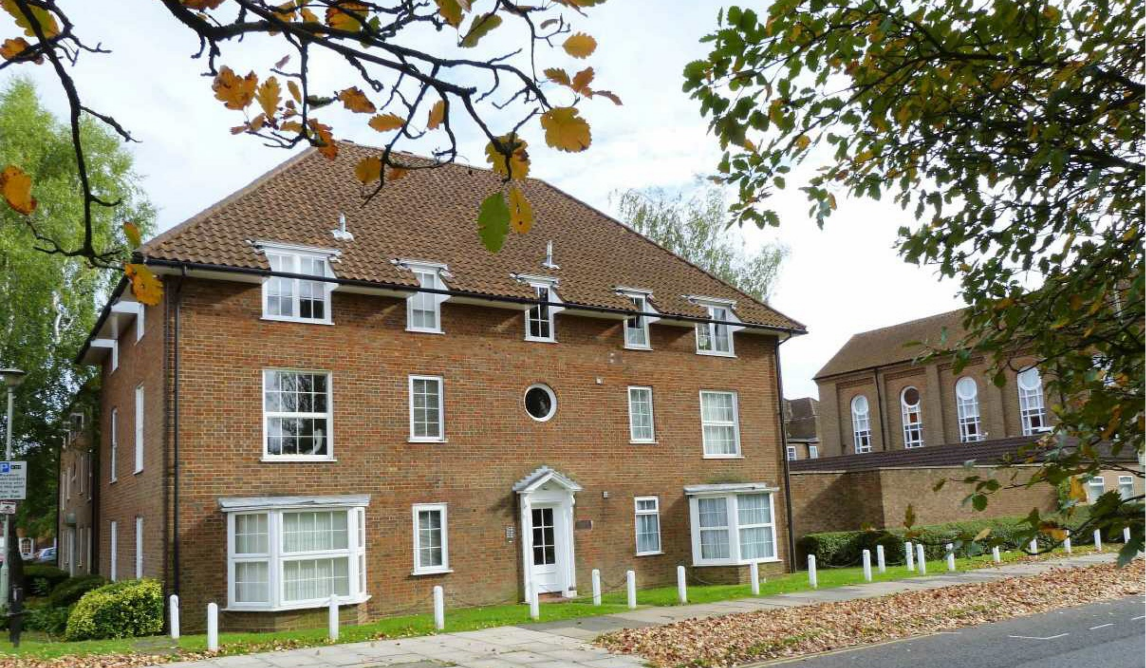
12 The Cloisters, West Side, Welwyn Garden City, AL8 6DX Guide price £205,000