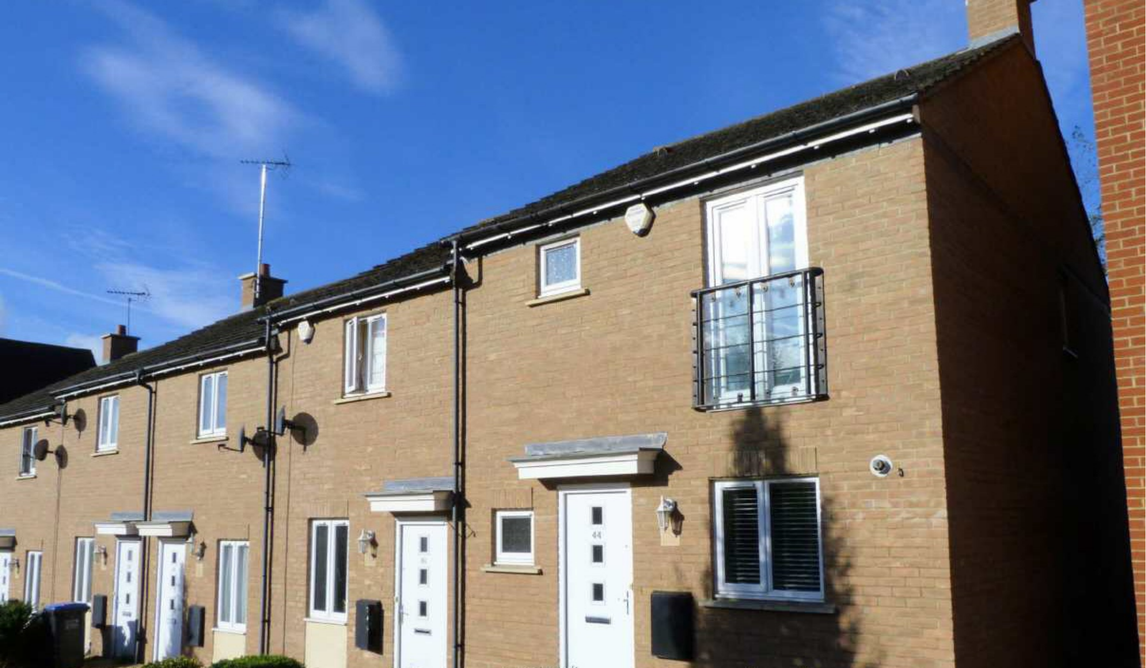
44 Eddington Crescent, Welwyn Garden City, AL7 4SQ Guide price £375,000