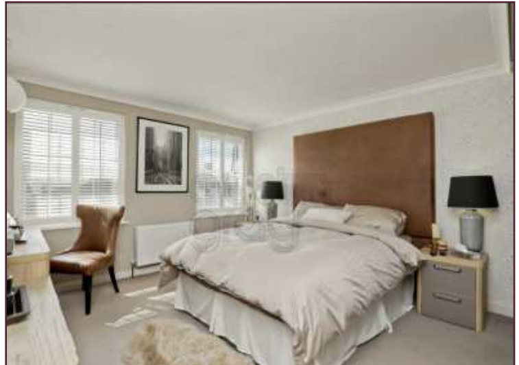
Flat 3, 65 The Upper Drive, Hove, BN3 6NA Offers in the region of £450,000