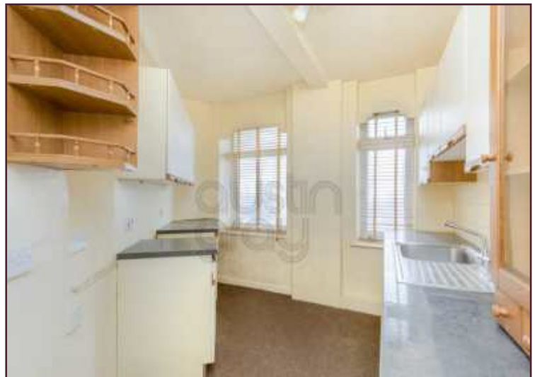
2, 143 Viceroy Lodge, Hove, BN3 4RA £250,000