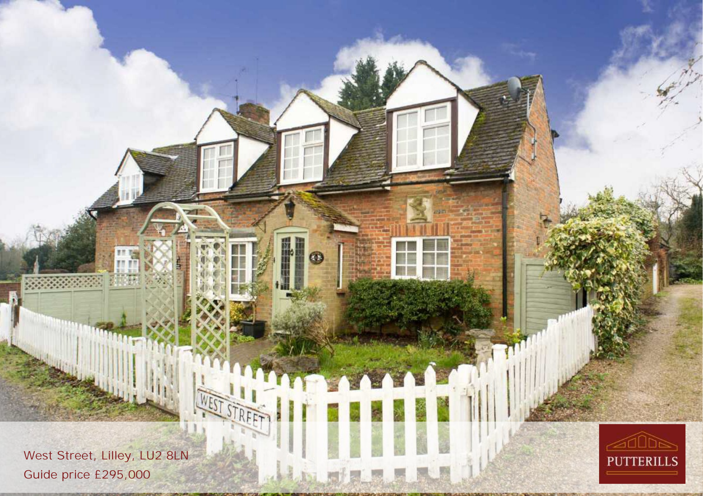
West Street, Lilley, LU2 8LN Guide price £295,000