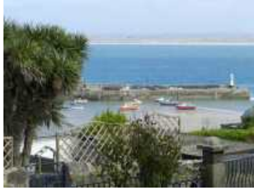
View from Barnoon Terrace