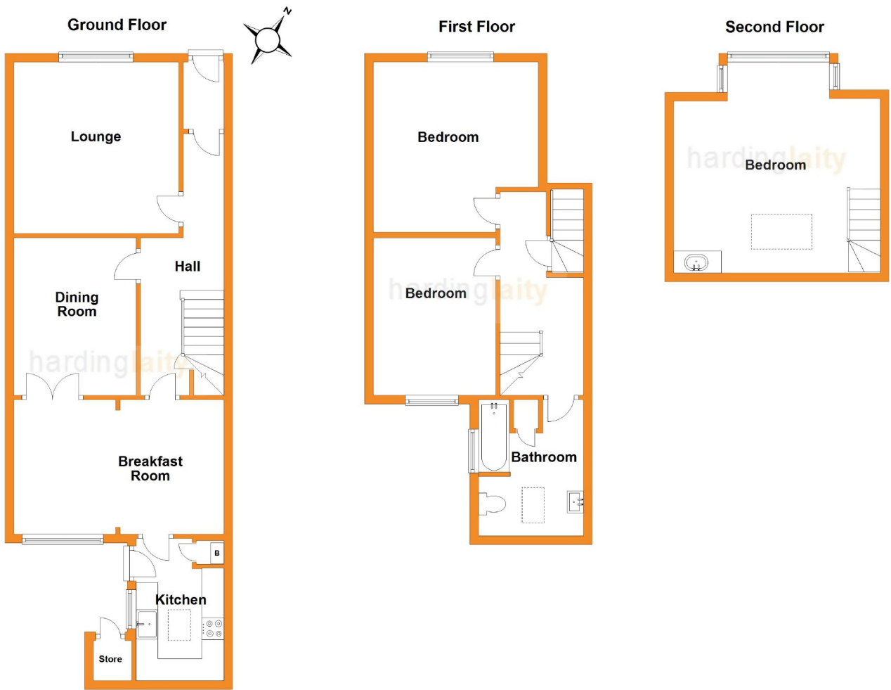
9 Barnoon Terrace, St Ives