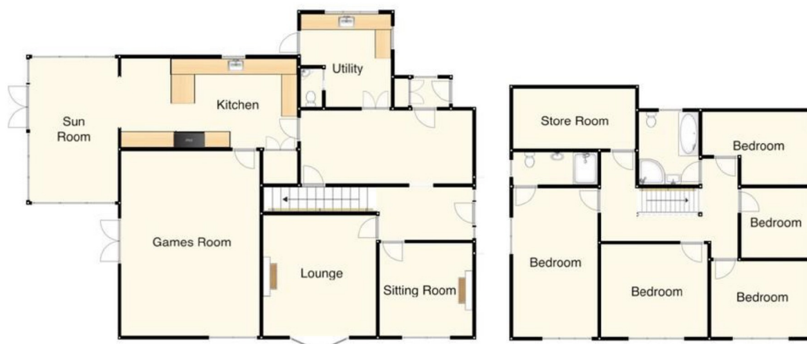
Llyscoed SA44 5YD For illustrative purposes only, not to scale