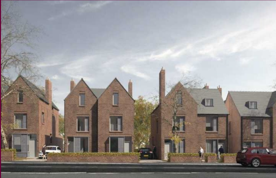
Plot 14 Mauldeth Green Burnage Guide price £365,000