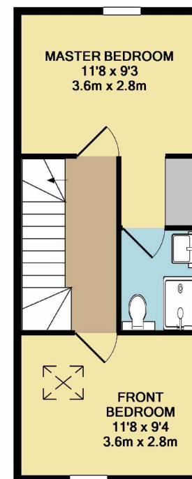
2ND FLOOR APPROX. FLOOR AREA 346 SQ.FT. (32.2 SQ.M.)

Heaton Moor Branch 14 Moorside Road, Heaton Moor, Stockport, Cheshire, SK4 4DT | 0161 432 1115 theheatons@julianwadden.co.uk | www.julianwadden.co.uk