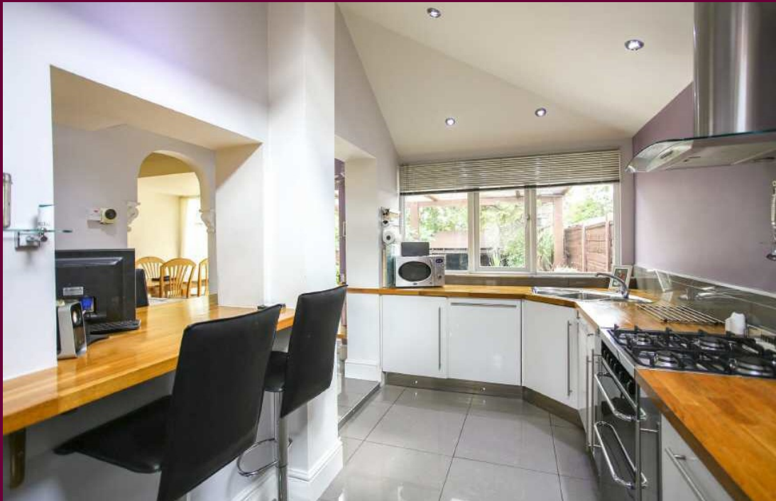
6 Fencegate Avenue Heaton Chapel Guide price £329,950