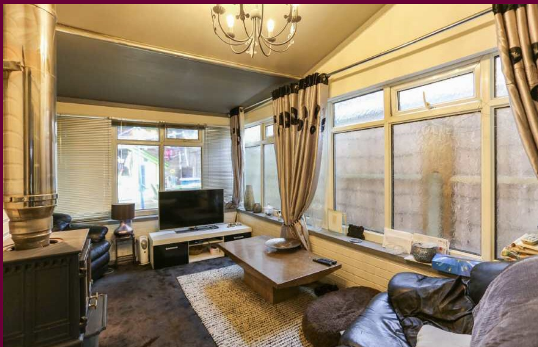
8 Birchwood Close Heaton Mersey Guide price £365,000