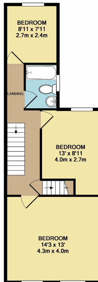
1ST FLOOR APPROX. FLOOR AREA 493 SQ.FT. (45.8 SQ.M.)

TOTAL APPROX. FLOOR AREA 1256 SQ.FT. (116.6 SQ.M.) Made with Metropix ©2019