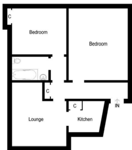
Illustrative only. Not to scale