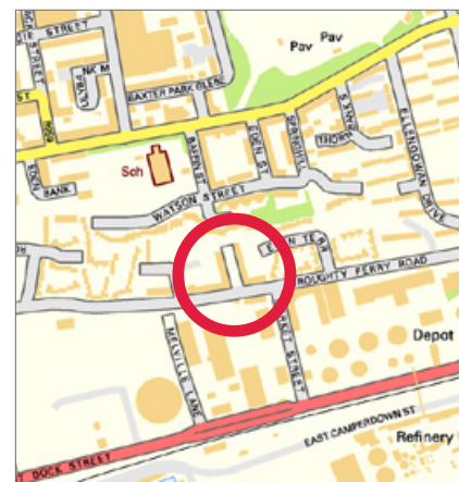
Contains Ordnance Survey data © Crown copyright and database 2017

Thorntons is a trading name of Thorntons Law LLP.