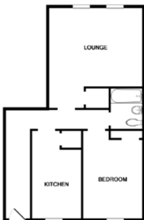
Illustrative only. Not to scale