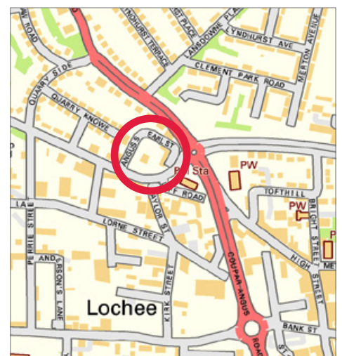
Contains Ordnance Survey data © Crown copyright and database 2017

Thorntons is a trading name of Thorntons Law LLP.