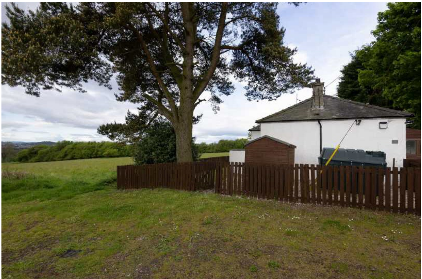
Holding 22, Barns Of Claverhouse, Dundee, DD3 0QF