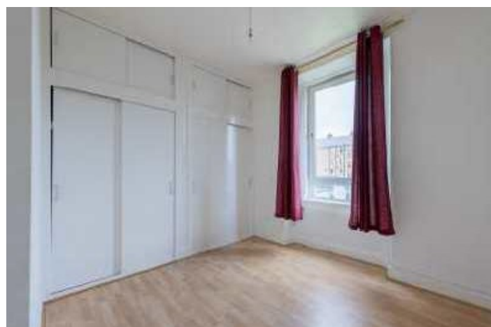
Illustration For Identification Purposes Only. Not To Scale (ID584882 / Ref:71499)

Thorntons is a trading name of Thorntons LLP. Note: While Thorntons make every effort to ensure that all particulars are correct, no guarantee is given and any potential purchasers should satisfy themselves as to the accuracy of all information. Floor plans or maps reproduced within this schedule are not to scale, and are designed to be indicative only of the layout and location of the property advertised.