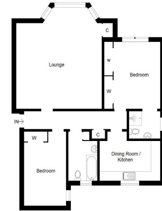
Illustration For Identification Purposes Only. Not To Scale (ID618301 / Ref:72871)