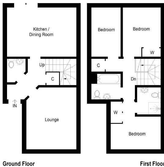
Illustration For Identification Purposes Only. Not To Scale (ID530612 / Ref:69477)