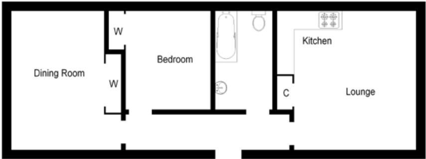
Illustrative only. Not to scale.