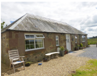
Sportsman's Lodge, Purgavie, Lintathen, By Kirriemuir, DD8 5HZ