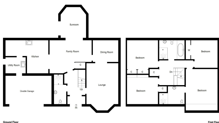
Illustration For Identification Purposes Only. Not To Scale (ID:355569 / Ref:61363)

Thorntons is a trading name of Thorntons LLP. Note: While Thorntons make every effort to ensure that all particulars are correct, no guarantee is given and any potential purchasers should satisfy themselves as to the accuracy of all information. Floor plans or maps reproduced within this schedule are not to scale, and are designed to be indicative only of the layout and location of the property advertised.