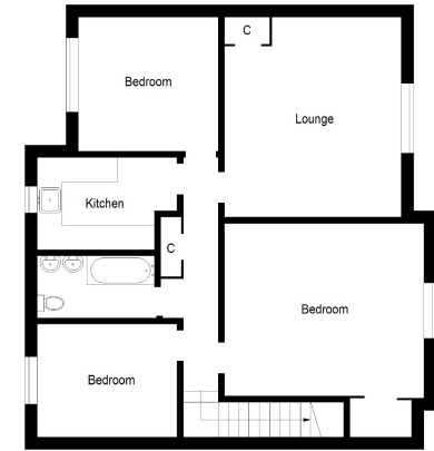
Illustration For Identification Purposes Only. Not To Scale (ID:754840 / Ref:77270)

aspc êspc fifespc pspc tspc spc scotland