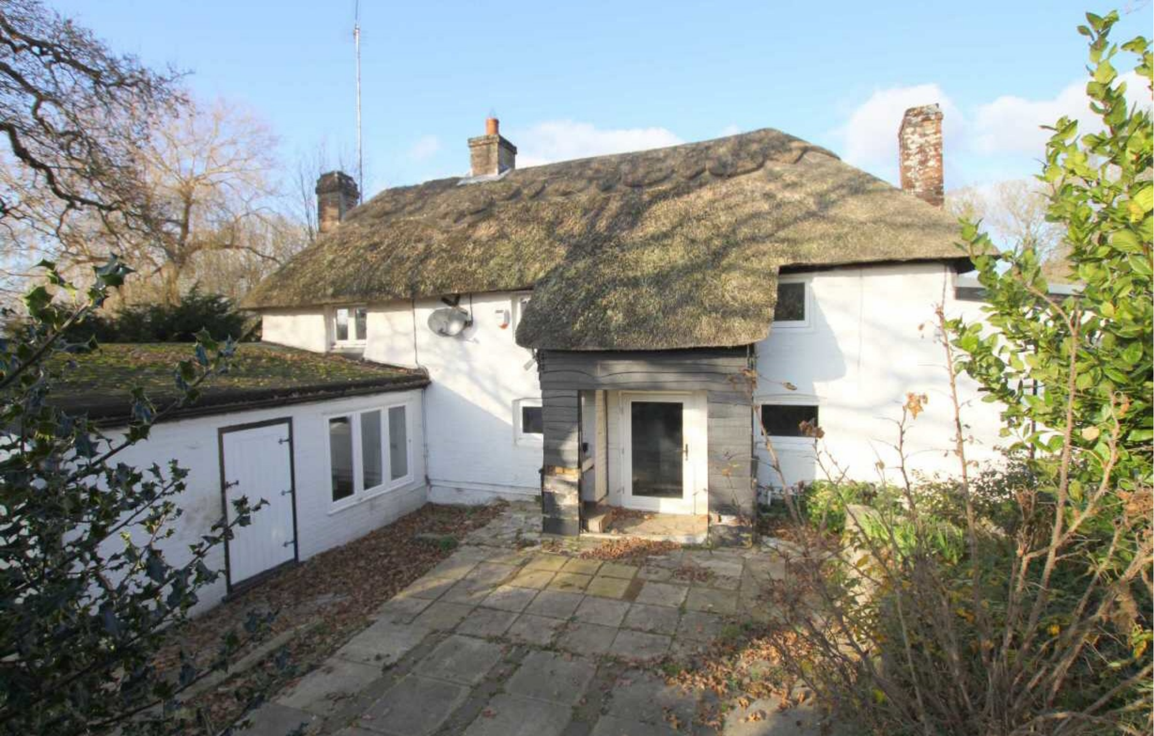
The Thatch, Lyndhurst Road, Highcliffe, BH23 4SG