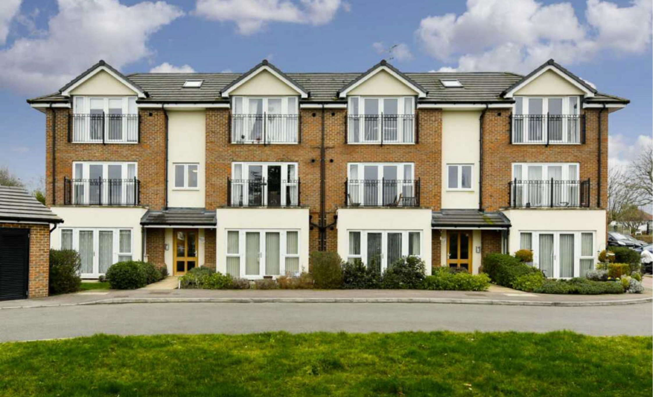
Swallow House, Epsom, KT19 0AF