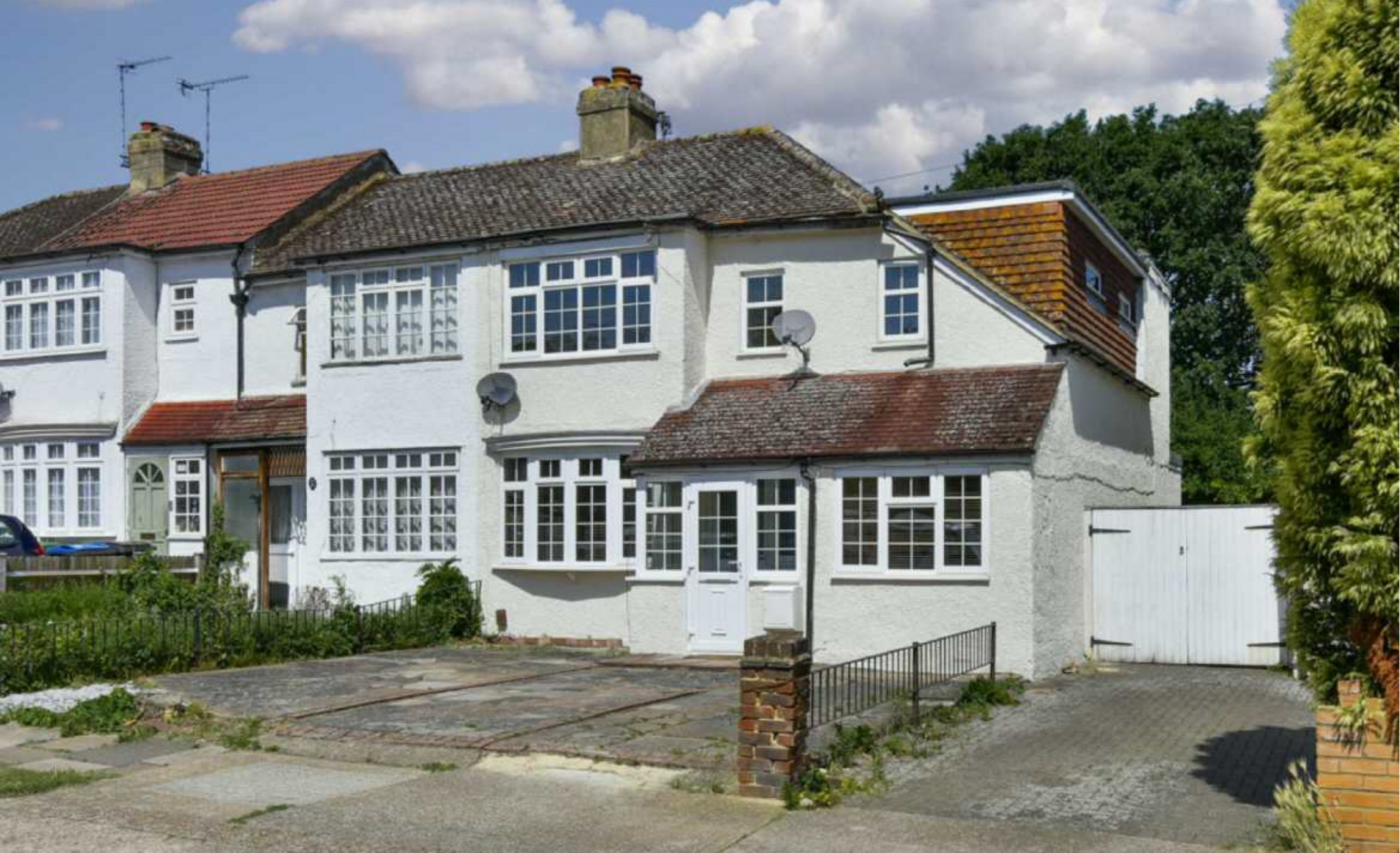
Rollesby Road, Chessington