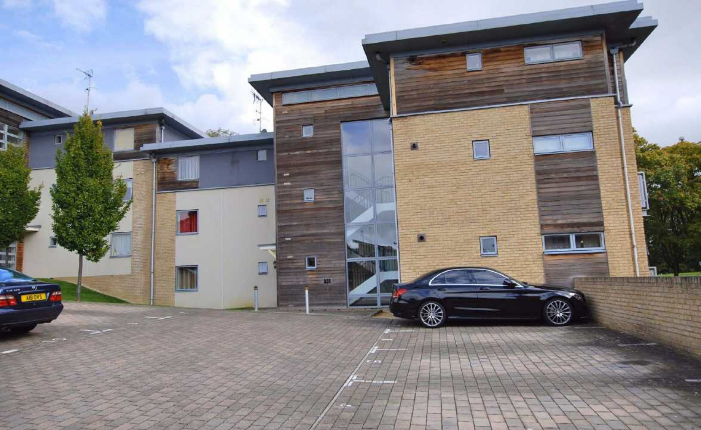
11 Corinne Court, Cheltenham, GL51 0FW £160,000