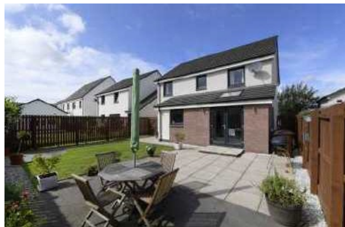
1 Pioneer Place Renfrew | PA4 8ZE

Internal inspection necessary to appreciate the quality of accommodation on offer.