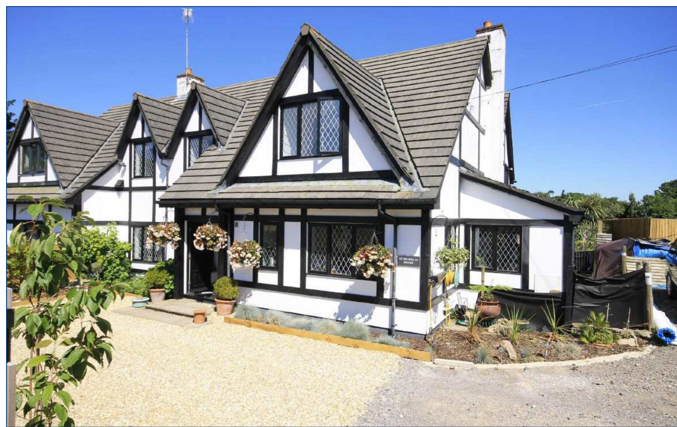
St Nicholas House, St Nicholas, CF5 6SJ