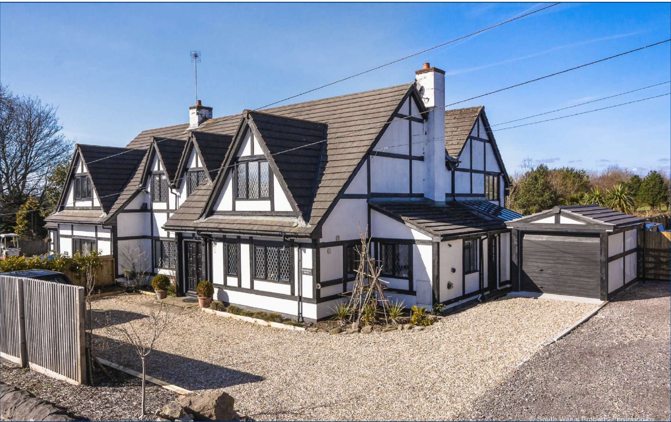
St Nicholas, CF5 6SJ £750,000