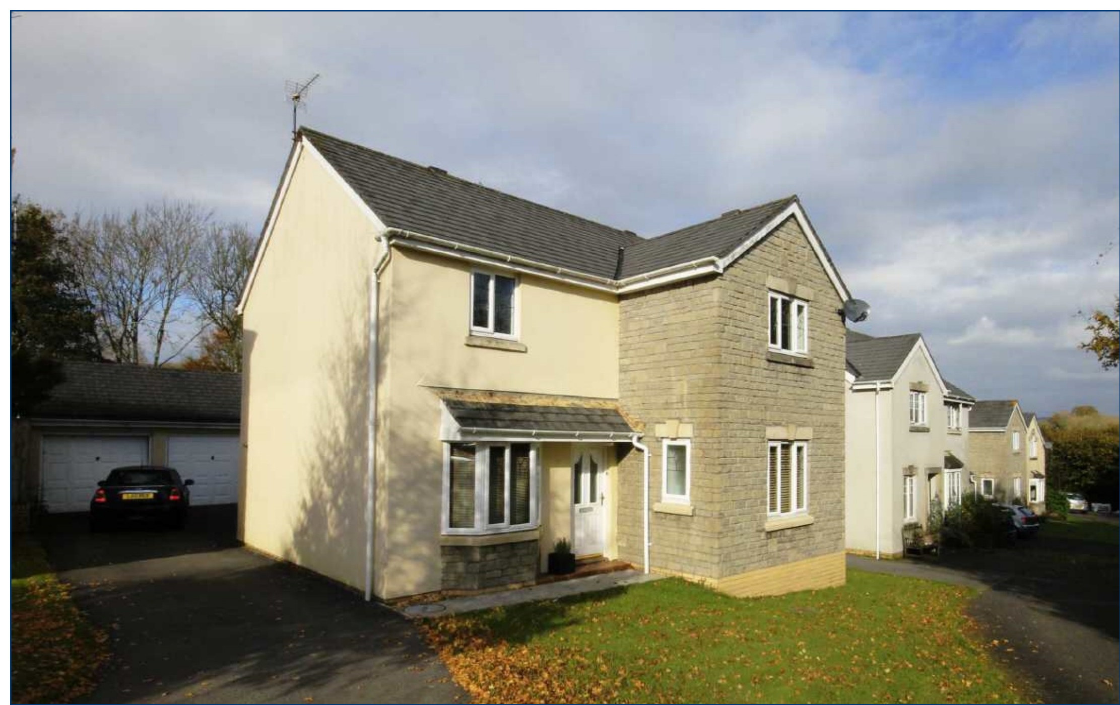
Badgers Brook Close, Ystradowen, CF71 7TY Offers in excess of £375,000