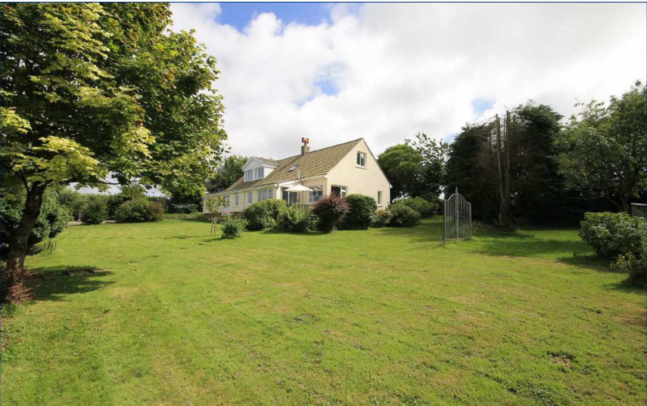
The Cherries, Pendoylan, CF71 7UJ £775,000