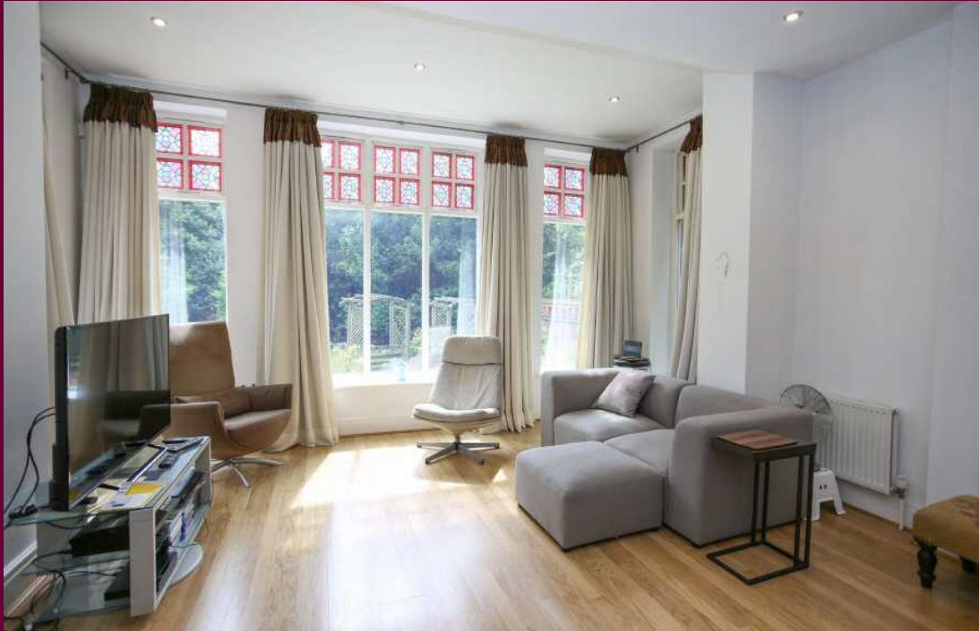
Apt 2 Trewinnard Hall 50 Barlow Moor Road, Didsbury Guide price £250,000