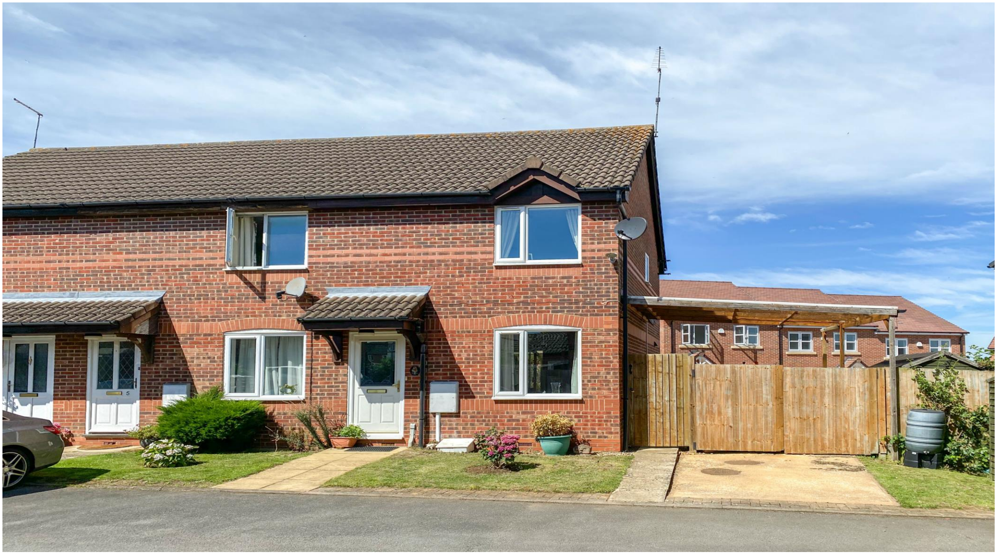
Hedgely Court Buckingham Fields, Northampton