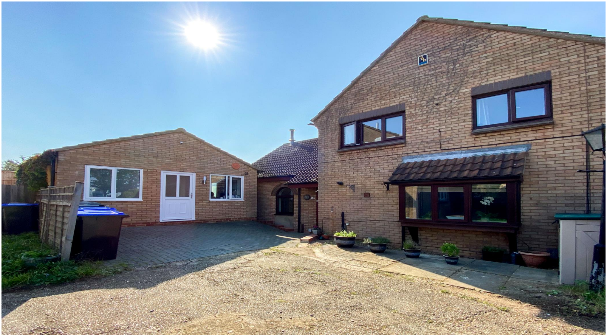
Quernstone Lane Danefield, Northampton