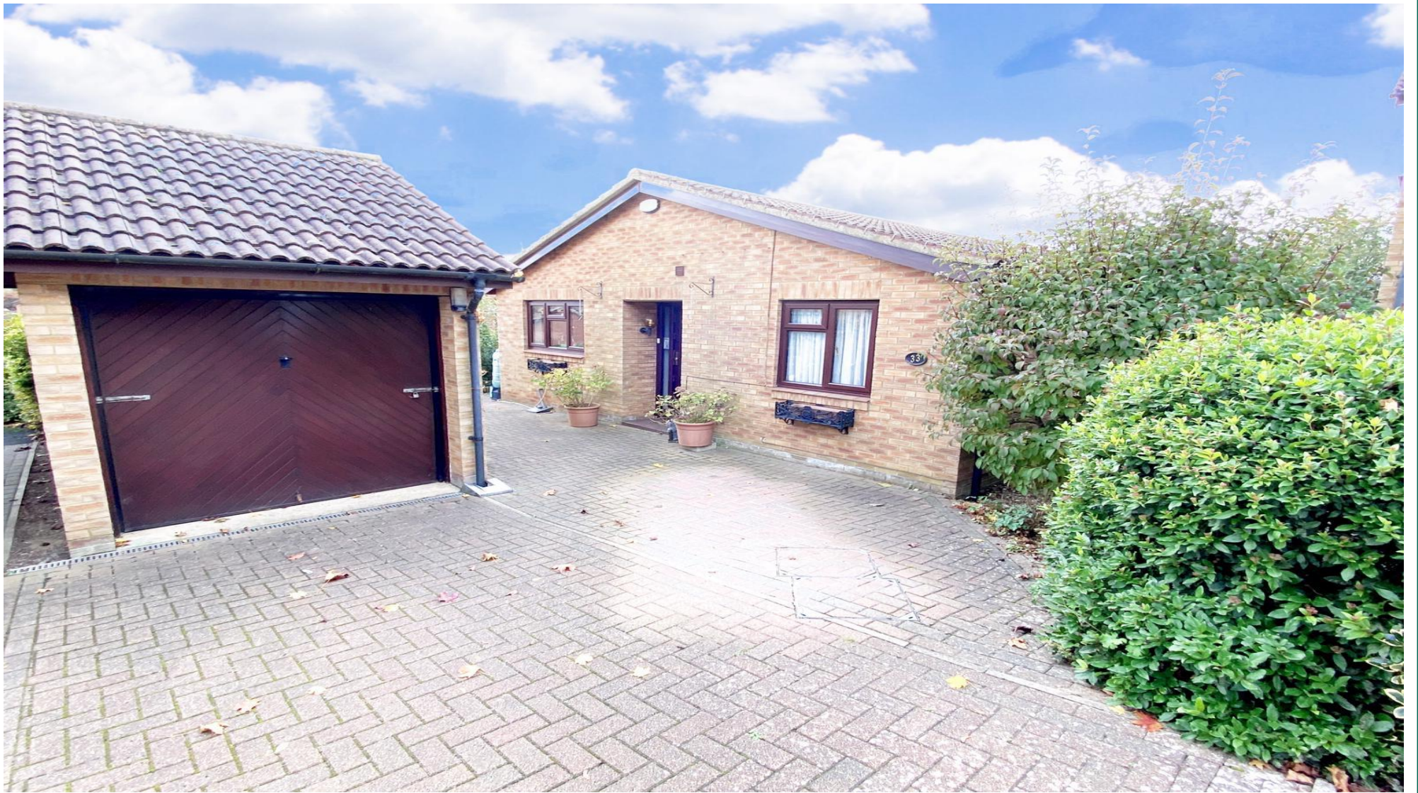
Grangewood East Hunsbury, Northampton