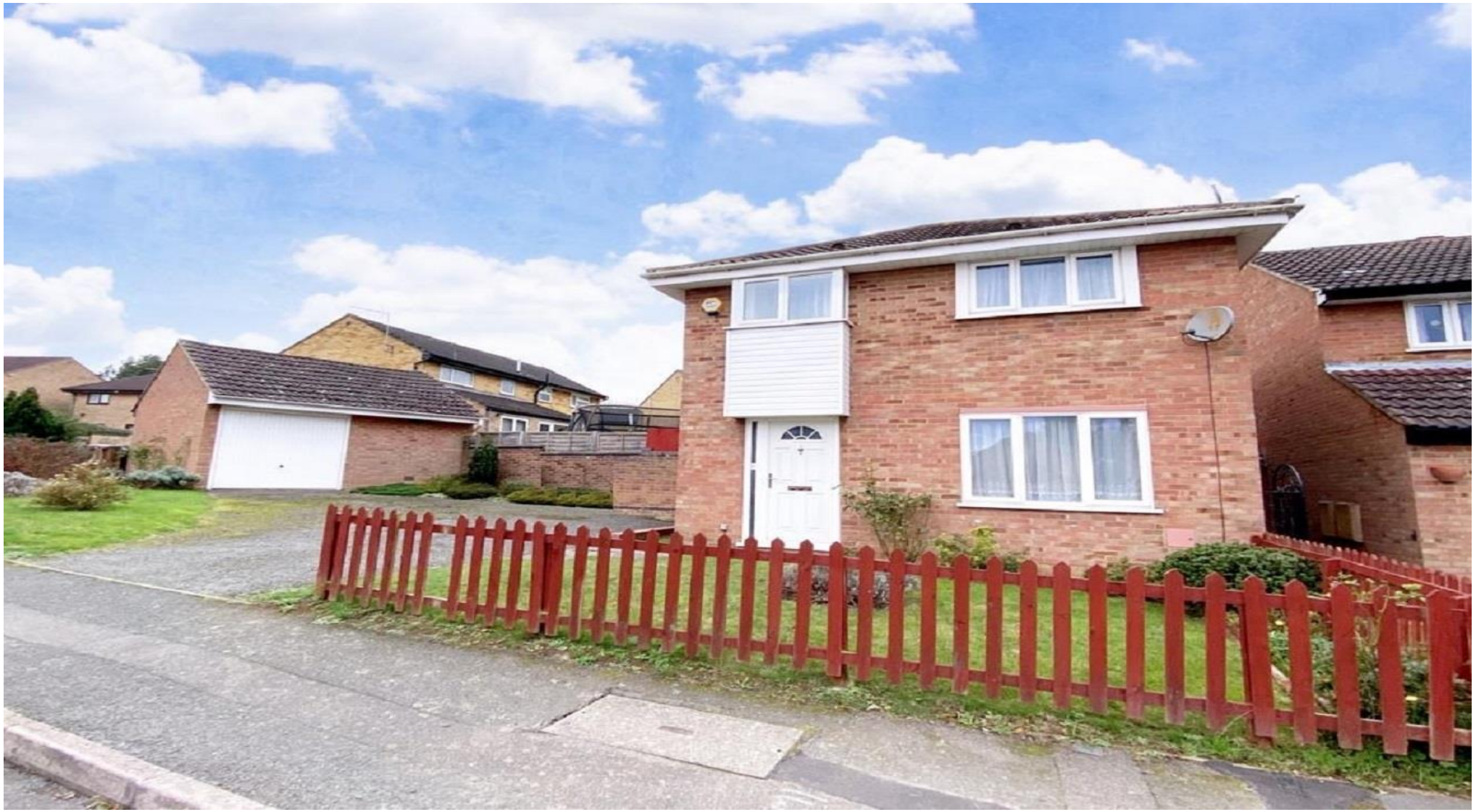
Floribunda Drive Roselands, Northampton