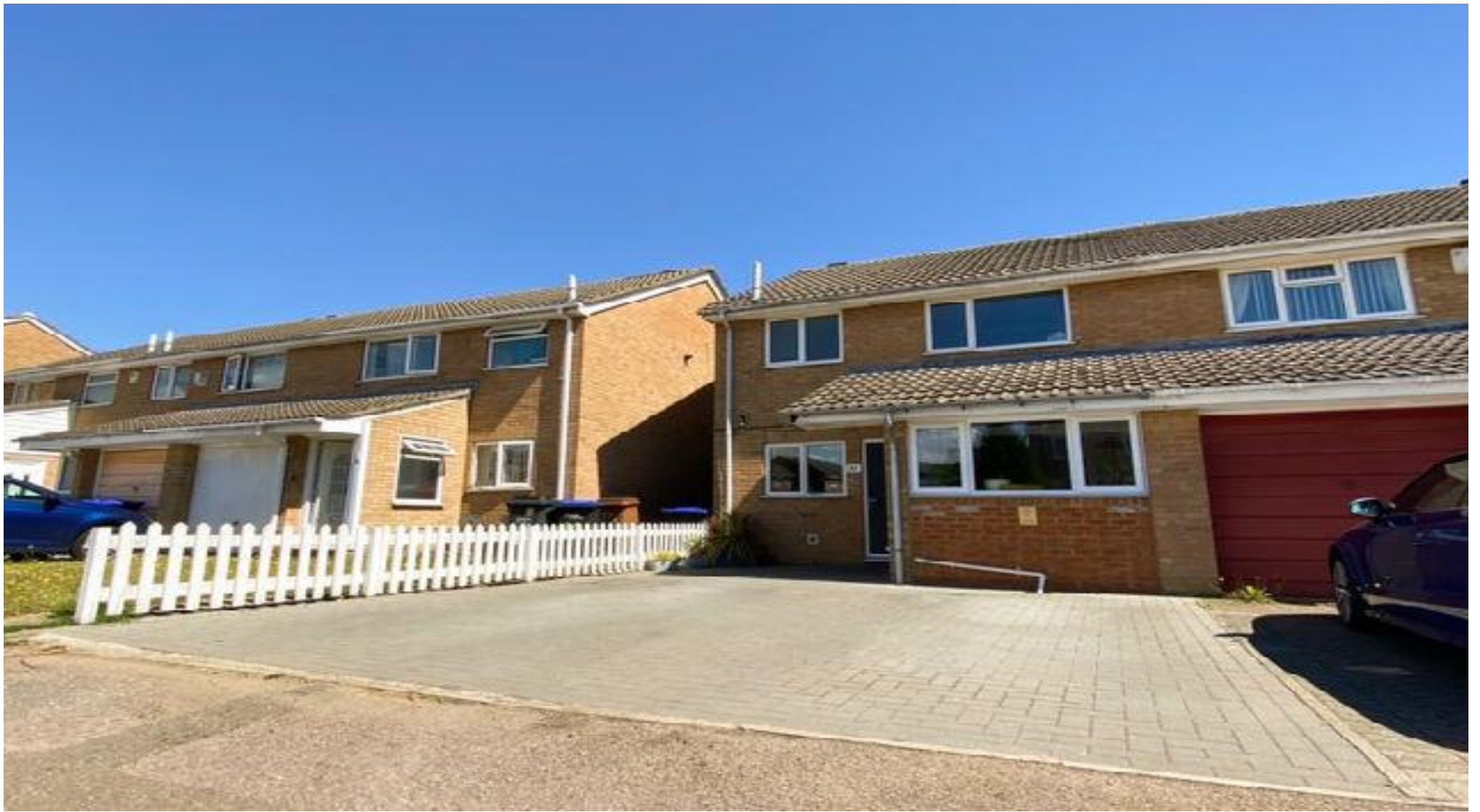
Oleander Crescent Cherry Lodge, Northampton