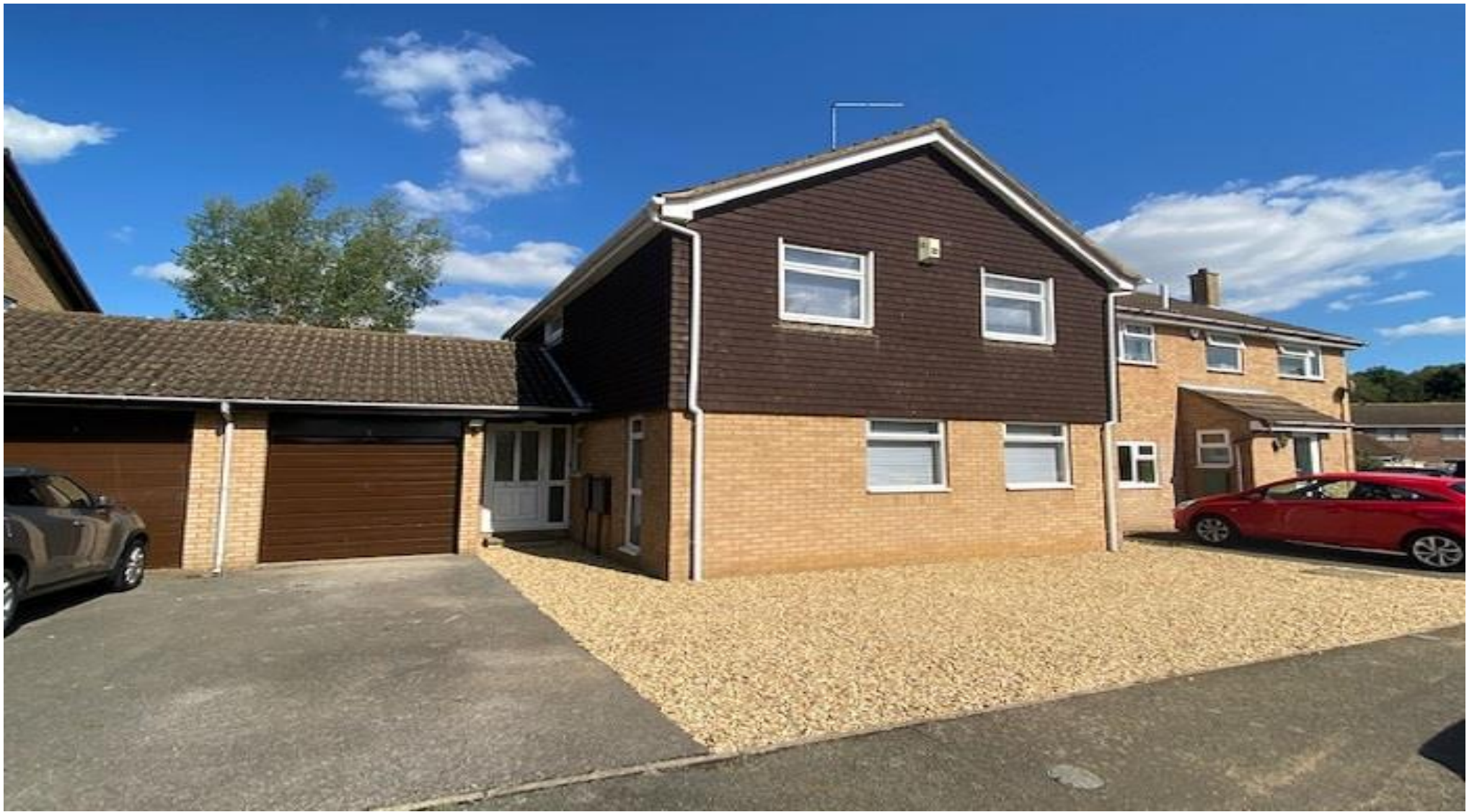
Millbank Ecton Brook, Northampton