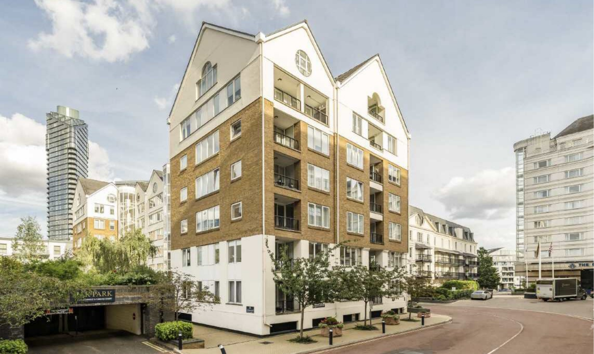
The Quadrangle, SW10 £799,950