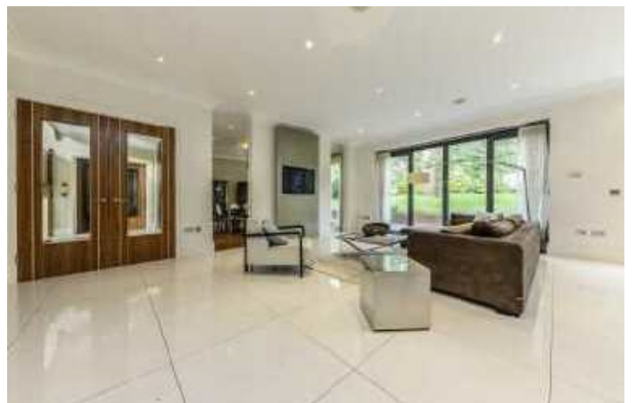
Neville Avenue, KT3