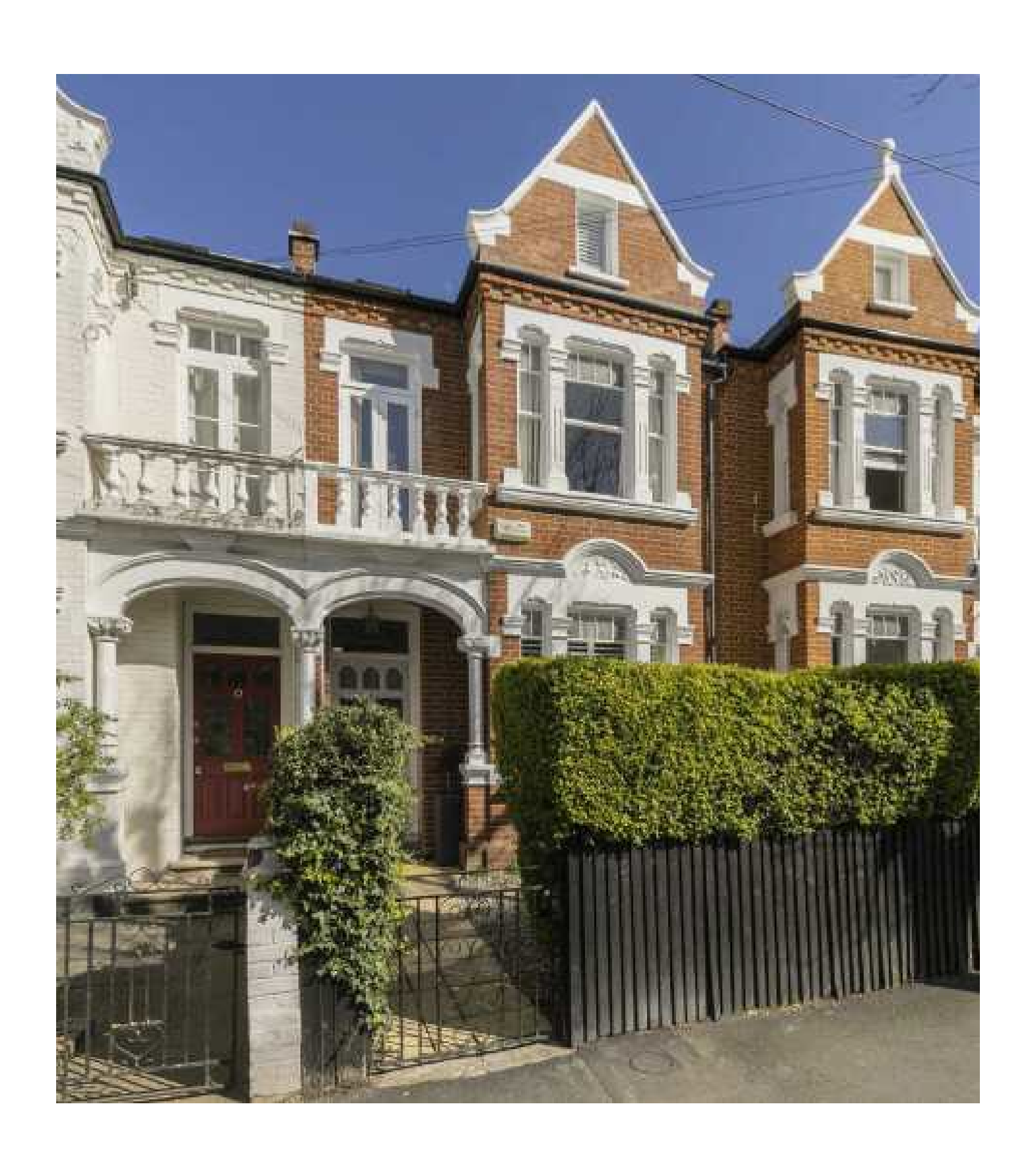
Crescent Lane, SW4 £1,850,000