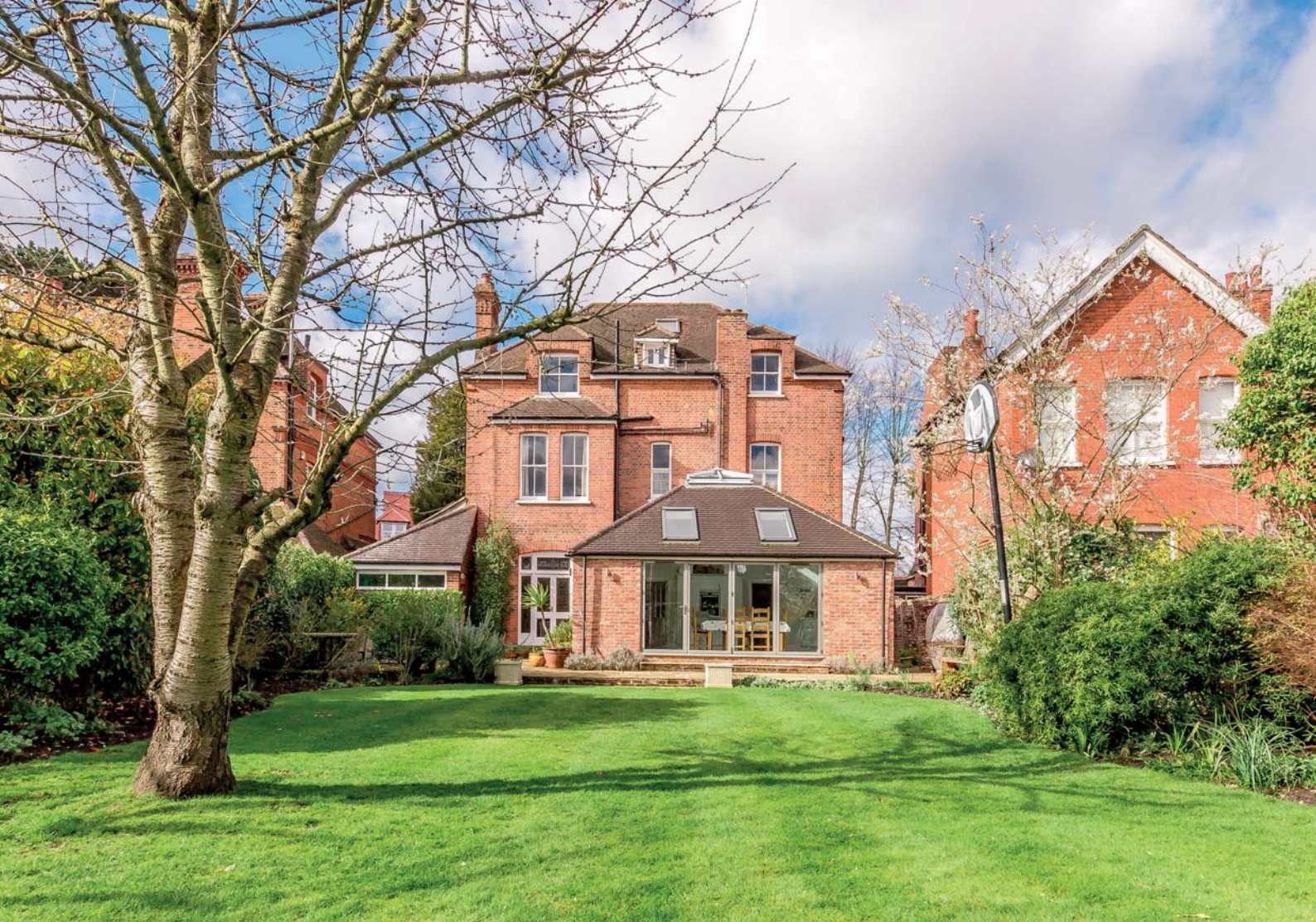
Strawberry Hill Road Strawberry Hill, TW1