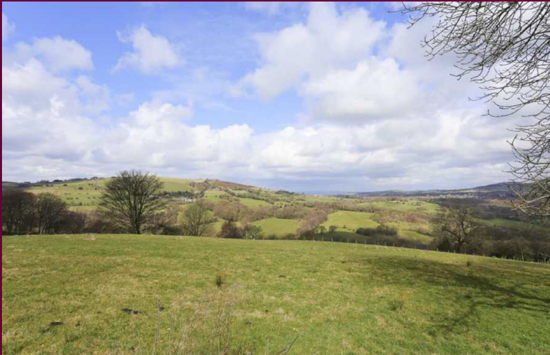
Glossop Road Marple Bridge Guide price £225,000