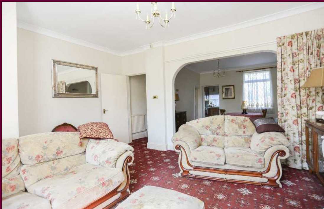
53 Higher Bents Lane Bredbury Guide price £135,000