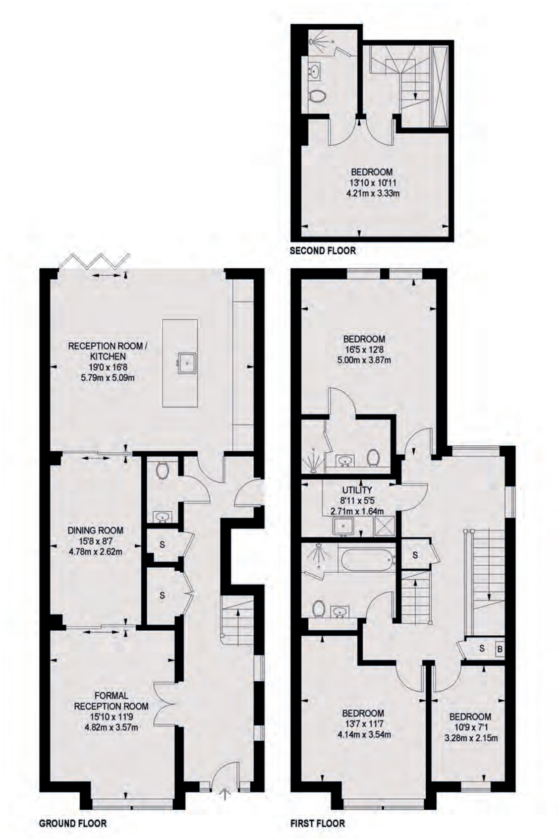
Plot B - 58 Denton Road