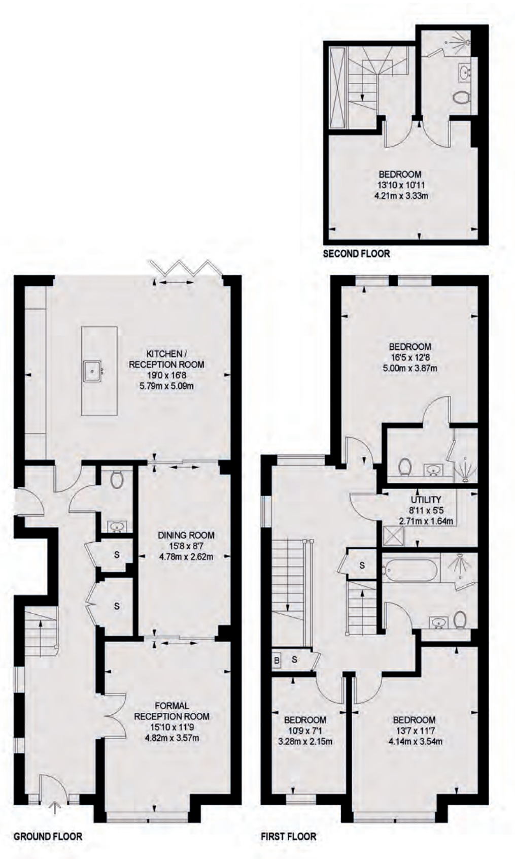
Plot A - 58 Denton Road