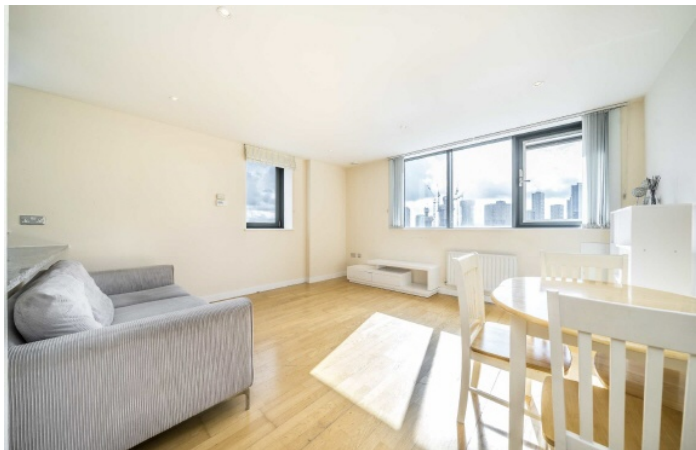
East India Dock Road, E14