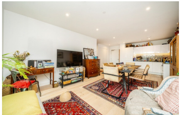
Bonnet Street, E16