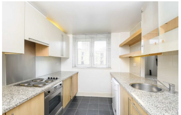
Westferry Road, E14