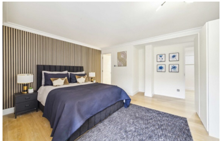
Drayton Gardens, SW10