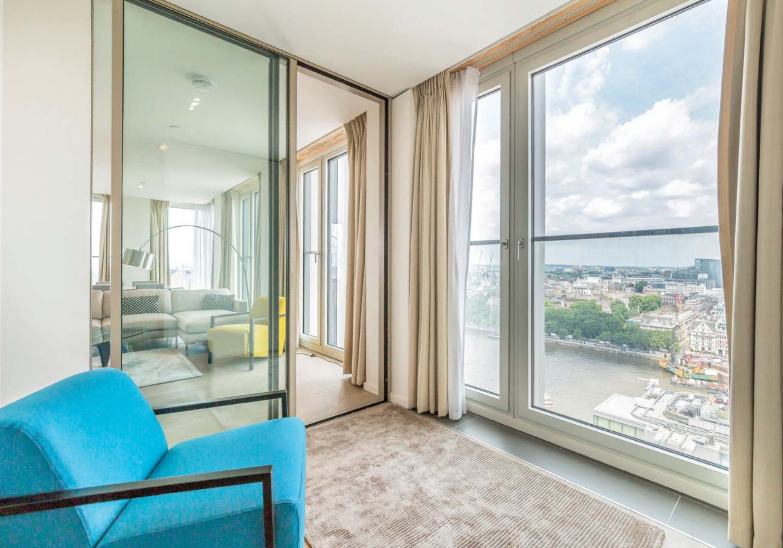
South Bank Tower, South Bank London, SE1